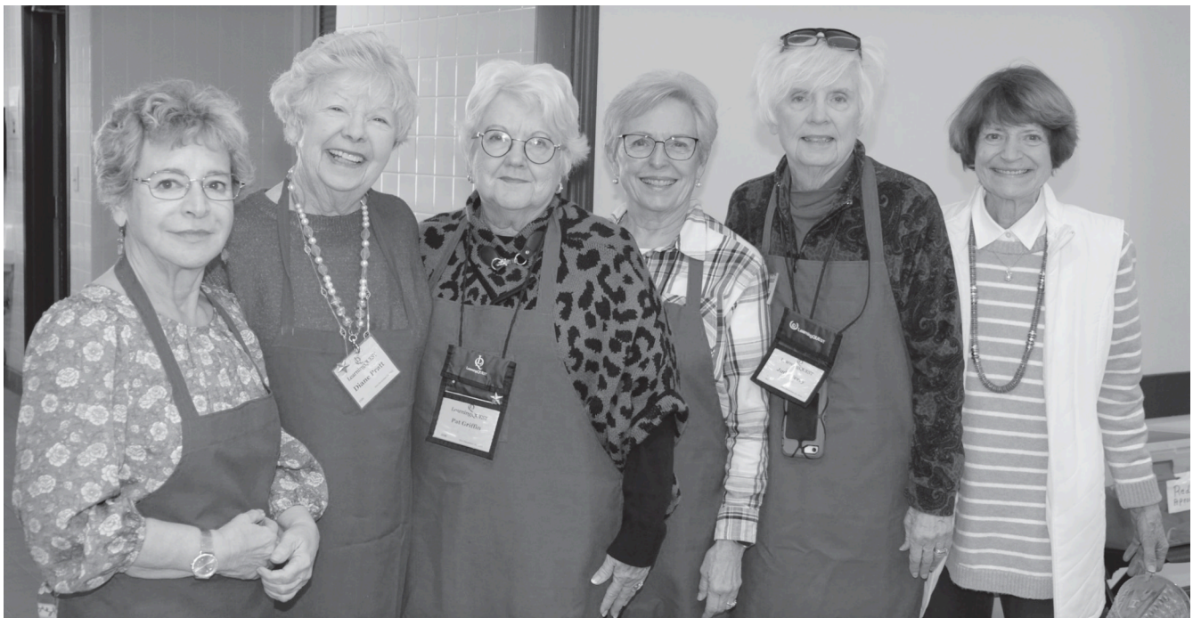
Rally Day Hospitality Team