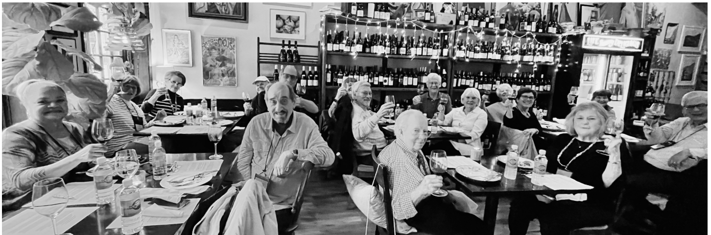
Wine Tasting Course